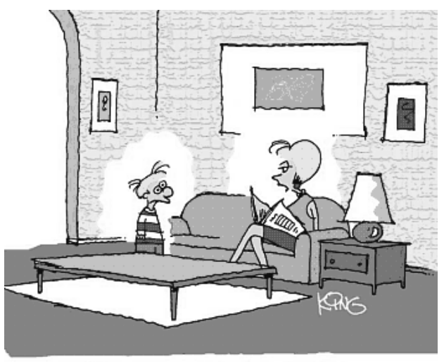
"No, you weren't downloaded. Your were born."

Figure and table captions should be centered if less than one line (Figure 1), otherwise justified and indented by 0.8cm on both margins, as shown in Figure 2. The caption font must be Helvetica, 10 point, boldface, with 6 points of space before and after each caption.